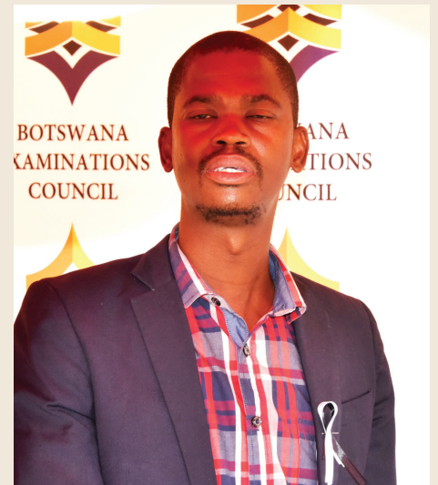
Mantshwabisi village Councillor giving vote of thanks.