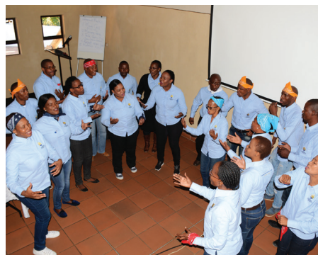
BEC Choir entertaining the audience.