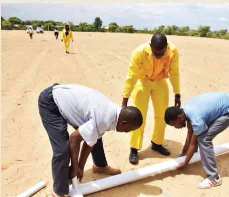
BEC staff setting up the soccer poles at Mantshwabisi Primary School.

The equipment is expected to impact the lives of Mantshwabisi Primary School students.