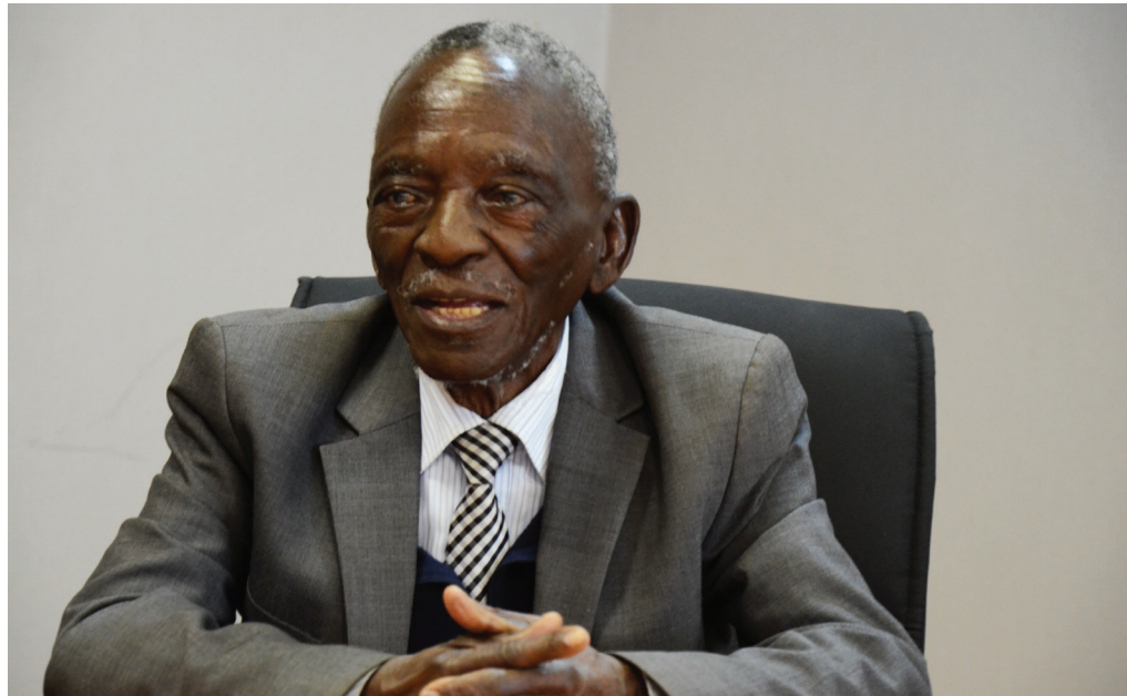
Mr. K.P. Morake was the longest serving Minister of Education