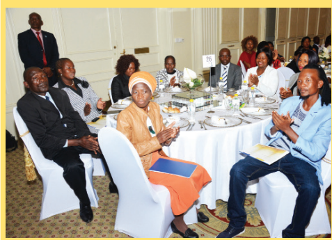
Invited guests during the award ceremony.