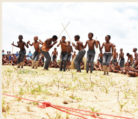
Mantshwabisi Primary School traditional dance entertaining the guests at the handover.