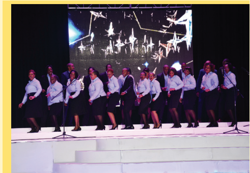
BEC choir entertaining the audience.