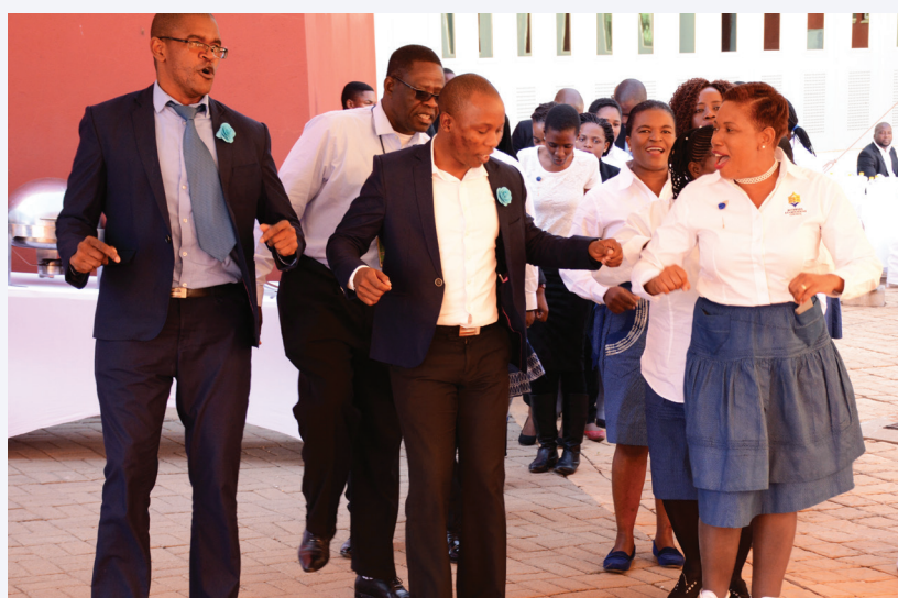
BEC choir doing what they do best