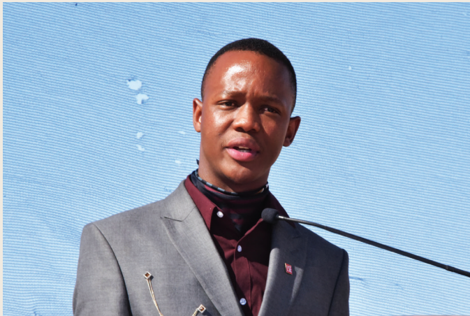
Former BGCSE Top Achiever Mr Kaone Disepo giving overview of the Ministry of Basic Education.