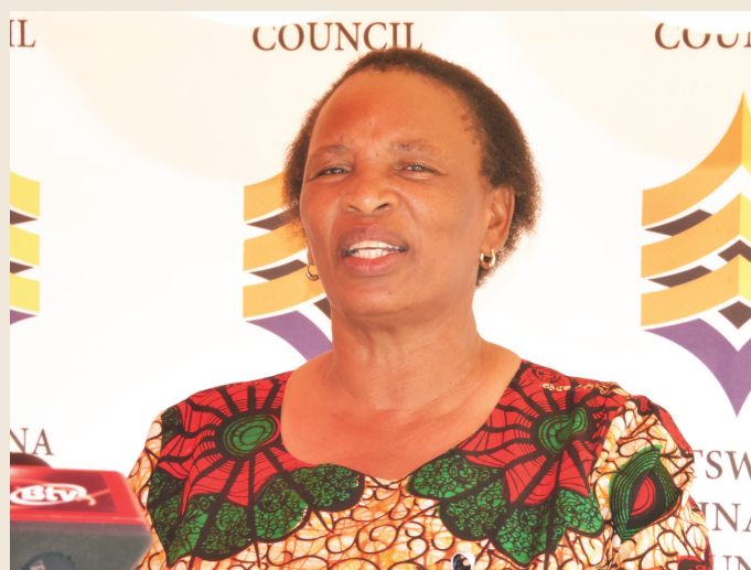
Mantshwabisi Primary School School Head expressed gratitude to BEC's gesture