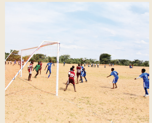
Mantshwabisi Primary School soccer team battling it out with Sirinane Primary School during a friendly encounter.