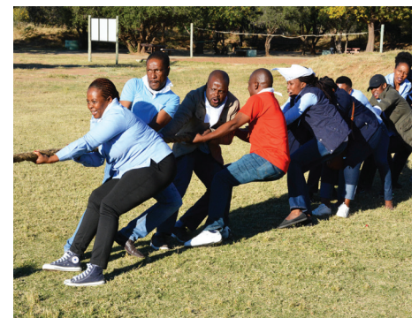
BEC staff partaking in the team development activities as part of the days proceedings.