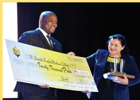
Minister of Tertiary Education, Research, Science and Technology Dr. Alfred Madigele presenting St. Arnold's English Medium College with an Award for being the best PTA school for PLSE.