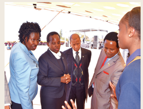
Dignitaries touring the stall setup by students from various schools from the the South East region.