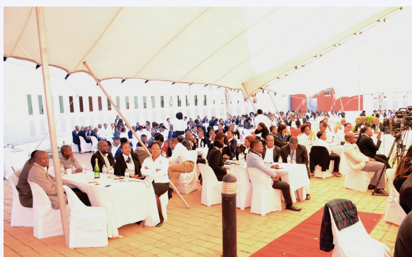
BEC staff listening to the day's deliberations.