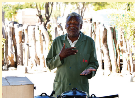
A village elder offering blessings in appreciation of the donation.