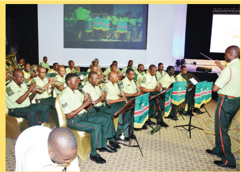
Botswana Defence Force band entertaining guests.