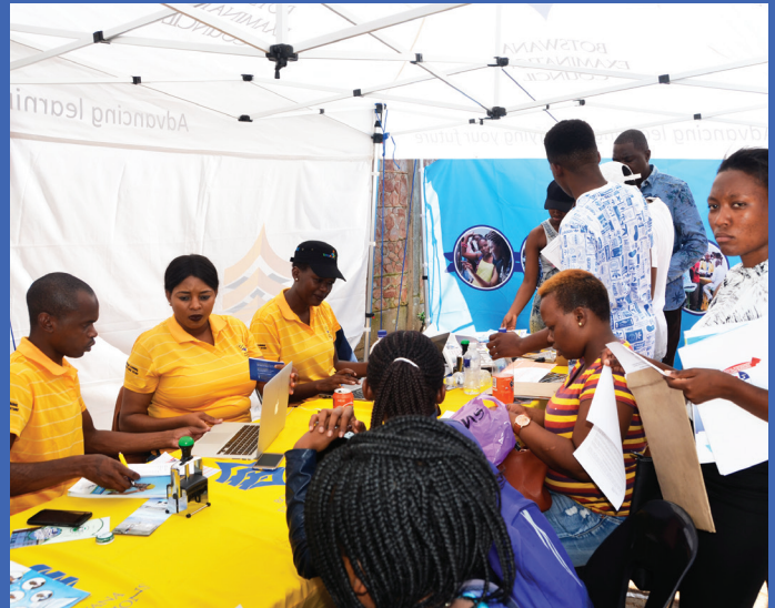
BEC representatives assisting multitudes of students at the HRDC Northern Fair