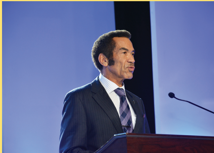
His Excellency the President Lt. Gen. Dr. Seretse Khama Ian Khama giving a keynote address at the awards ceremony.