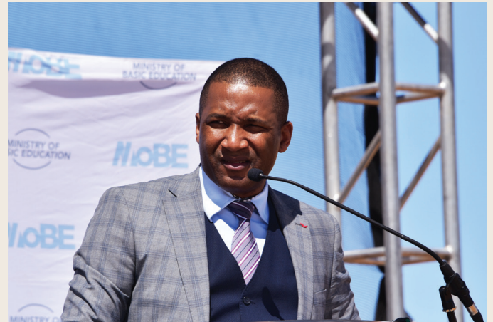
Area Member of Parliament Advocate Duma Boko giving a Vote of Thanks.

issues of quality, relevance, access, inclusion, equity and accountability across the entire sector, from pre-Primary school to Tertiary level.