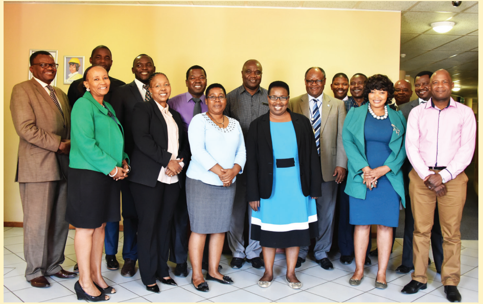
Malawian delegation posing for a group picture with BEC senior management after the benchmarking mission.