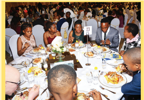
BGCSE Top Achievers networking with Minister of Basic Education Dr. Unity Dow.