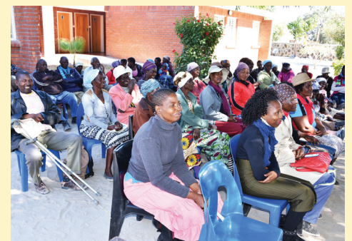
Gweta villagers came in numbers to receive the donation.